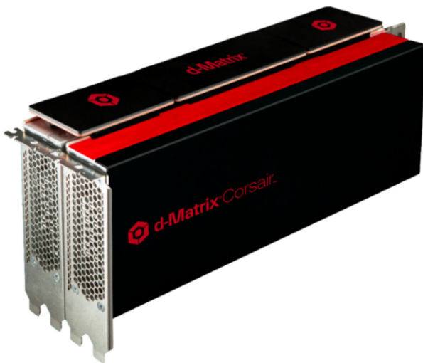
Table 2 lists the technical specifications of the Corsair PCIe dual card.